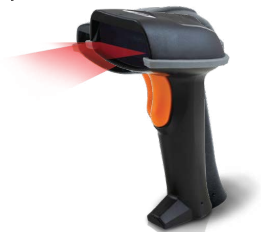
Model: NuScan 3300U