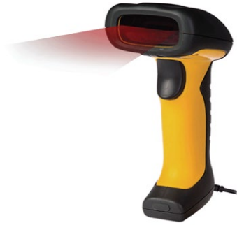
Model: NuScan 2400U