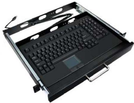
Model: ACK-730-MRP series