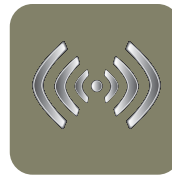
2.4 GHz Wireless Technology

Two convenient Internet navigation side buttons allow you to easily go back and forward when using your web browser.