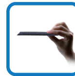
Ultra-Slim and Aluminum Design