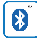
Bluetooth® 3.0 Wireless technology