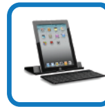
Universal Case Stand

The built-in polymer rechargeable battery can be recharged via the computer's USB port or USB power adaptor and lasts up to 100 hours of continuous use.