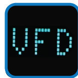
Vacuum Fluorescent Display