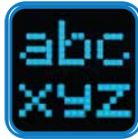
Displays up to 40 characters

The easy to read display also can be adjusted, and customized to your viewing preference for faster productivity. Adjust the display viewing angles up to 45°.