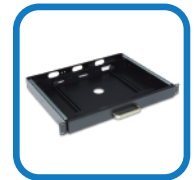
19" 1U Rackmount Keyboard Drawer